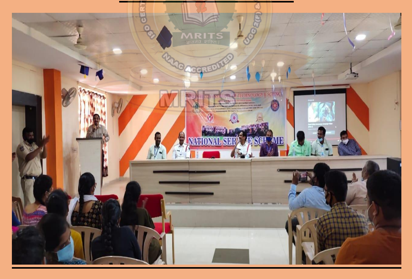
CSE(AI&ML) News Letter